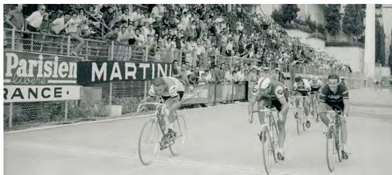
Anquetil - Poulidor sprint on the old Louis II stadium track

The Tour visited the Principality for the first time in 1939. After the war years, in 1946, Apo Lazaridès triumphed in a race of five stages, the Monaco-Paris, which heralded the return of the Tour a year later. In the 1950s, finishes in the Principality crowned Dutch riders Jan Nolten and Wim van Est then Raphaël Gémiani. And in 1964 the finish of the 9 th stage, Briançon-Monaco, was the backdrop to one of the epic Anquetil versus Poulidor battles. The Norman rider was the first to arrive on the cinder track of the original Louis II stadium. Poulidor drew level with him to battle for the sprint. However, upon crossing the finishing line he stopped riding whilst another lap of the finishing circuit still remained and Anquetil raced on. Poupou finished 5 th in the stage, leaving victory, and in particular the one minute bonus, to his rival. Soon after, Jacques Anquetil won his 5 th Tour in Paris... 55 seconds ahead of Raymond Poulidor.