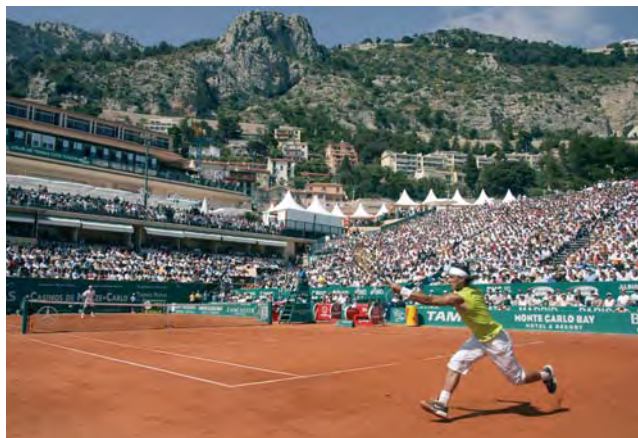
Monte-Carlo Master

In fact, this "small State" is fortunate to be governed by a sovereign who is an avid sports fan! It is not by simple coincidence or by precedence that Prince Albert is a member of the International Olympic Committee. A genuine Olympian, His Highness participated in four editions of the Winter Olympics as a pilot in the Monaco national bobsled team. A highly skilled judoka, he is also the ardent defender of a spectacular and unfairly eclipsed sport: the modern pentathlon. Without offending sensibilities, it can be affirmed