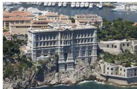
The oceanographic museum

In 1992, at the Rio Conference, Prince Rainier III pledged his support in favour of sustainable development. The evolution in the choice of modes of transportation in the city is marked by a desire to promote environment friendly alternatives. By creating the Monaco Prince Albert II Foundation in June 2006, the new sovereign is continuing in the same vein as his predecessors.